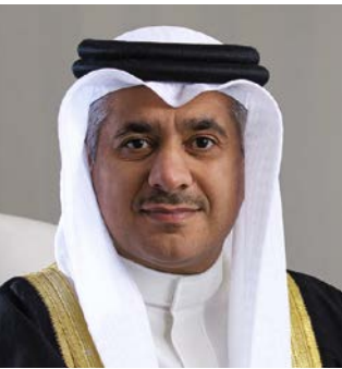
Kamal Bin Ahmed Mohammed Minister of Transportation and Telecommunications

Launched in 2014, BIA's modernization program has been fast tracked, construction is on time, over 60 percent complete and operational trials