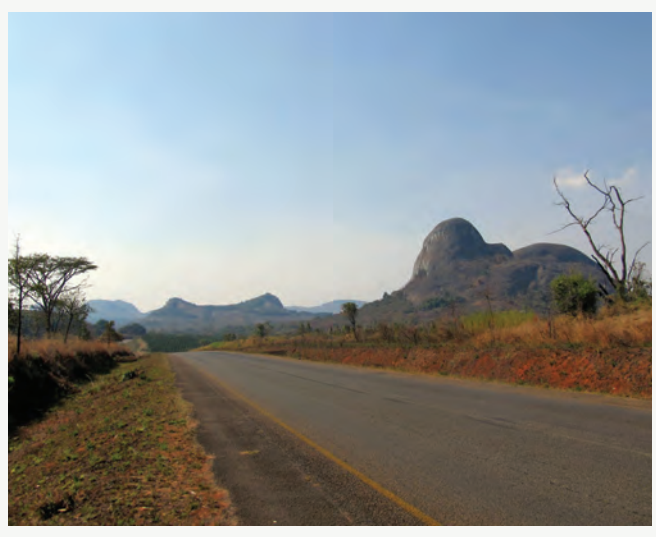
Malawi needs improvements to its transport infrastructure to better export goods

Another sector that relies heavily on excellent transport infrastructure is tourism. Tourists need easy access to all the important sites