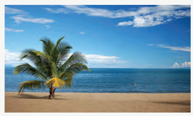
With beautiful freshwater beaches, wildlife and a stunning interior, Malawi has it all