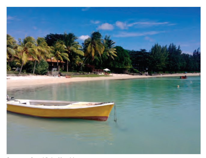
Cove near Grand Baie, Mauritius

and serving the nation. We have managed to get back on the path toward recovery and sustained profitability without any bailout."