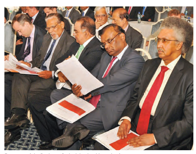
Front row of the Business Outlook leadership series forum

"Our port provides a very safe, quick and efficient transshipment