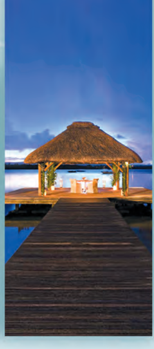
Quality of life

In Mauritius there is TIME for business, TIME for people, TIME for family and TIME to appreciate life.