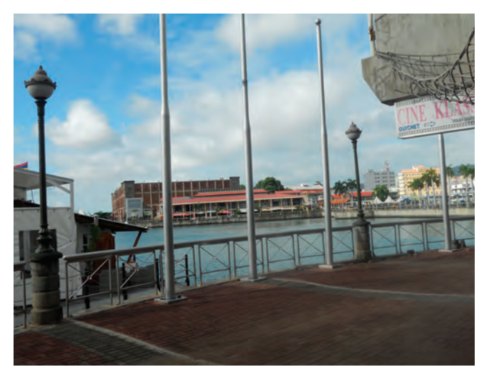
Le Caudan Waterfront, Port Louis, Mauritius

Salient features of the plan include terminal extensions to cater to up to 10 million passengers, the construction of a second runway, a