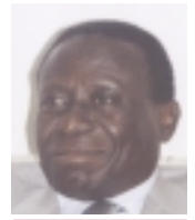
James Wapakhabulo, Minister for Foreign Affairs